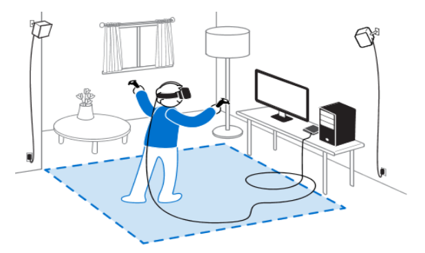
Fig. 1. Example of movement plan

For the physical controllers part, we will use the levers included in the HTC VIVE PRO virtual reality package. Setting them and setting specific buttons for movement is done by Unreal Engine: Settings -> Project settings -> Input -> Bindings. More precisely, it can be seen how the settings in the following set of figures are made.