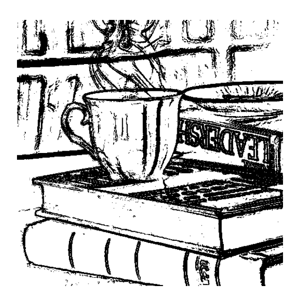
Fig. 4. Stego pixels used in the third pass