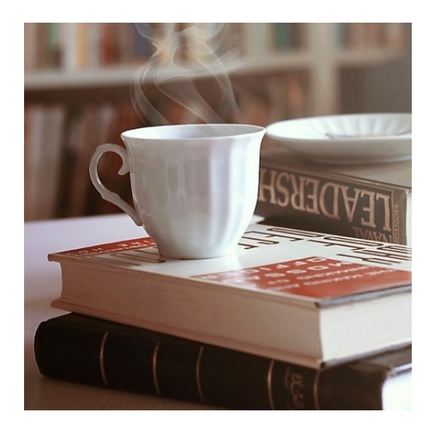
Fig. 2. Original image

The digital image container which was used for presenting the results of the proposed method is shown in figure 2 . It has a resolution of 512 x 512 pixels and occupies 512 x 512 x 3 / 1024 = 768 kB of memory. This container was filled up to full capacity with random data. Thus, in the first pass, all pixels of the image were used, resulting a capacity of 96 kB. This capacity was expanded in the second and third passes with 59 kB and 29 kB respectively, resulting a total capacity of 184 kB, that is more than enough to keep inside a payload of 9 JPEG images of good quality and having the same size as the container image. The capacity of the image container is 184 / 768 * 100 \approx 24\% . Of all the staganography techniques presented in paragraph 2, BPCS [1], [2] has the highest embedding capacity (approximately 50%).