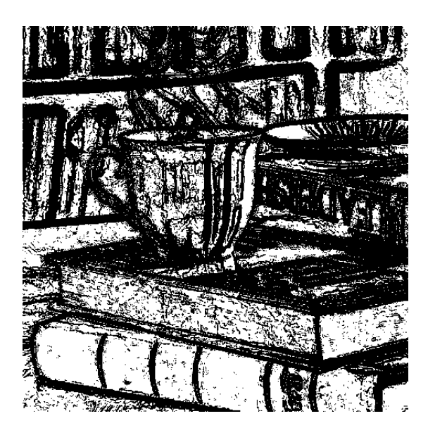
Fig. 3. Stego pixels used in the second pass

One of the most powerful steganography techniques is the genetic algorithm approach [9]. It is known to defeat all the steganalysis techniques. The proposed method has good strength, combined with larger capacity. Even if the entire capacity of the container is used, the chi-square attack [10] does not reveal anything, because the last bit of the pixels components was not used in the embedding process. Figure 5 presents the results of the chi-square attack applied on the stego image filled up to full capacity with random data.